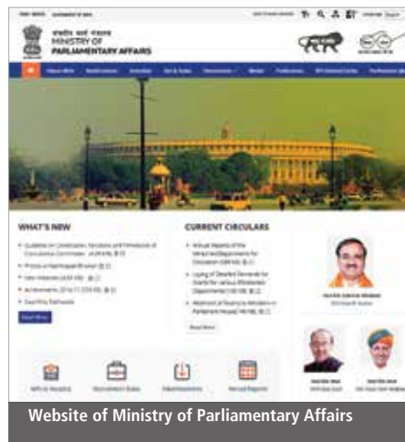
Website of Ministry of Parliamentary Affairs

In his welcome address, Secretary, MoPA briefed about NeVA. He appreciated the Legislative Houses of Madhya Pradesh, Punjab, Uttar Pradesh, Karnataka, Kerala, Puducherry and Manipur for having started using NeVA.