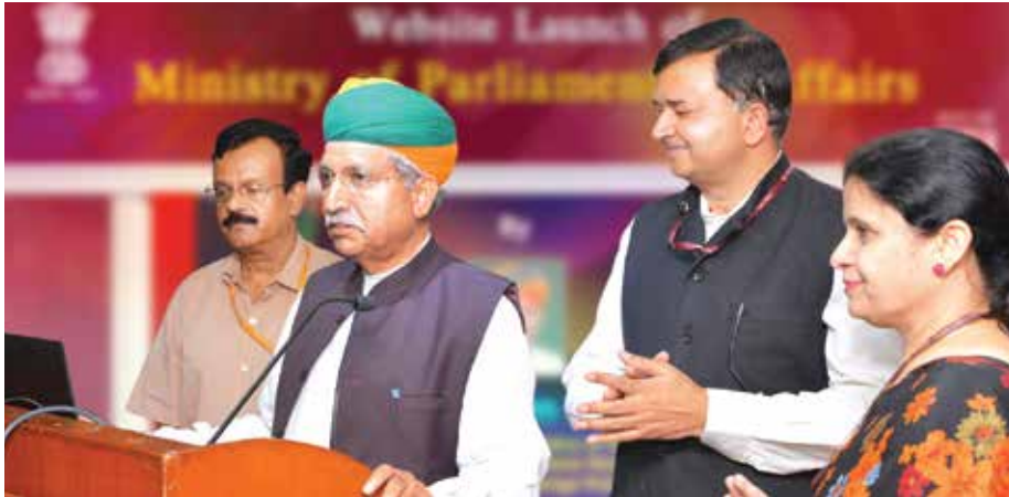
Hon'ble Minister of State, Shri Arjun Ram Meghwal during the inaugural ceremony of NeVA Workshop