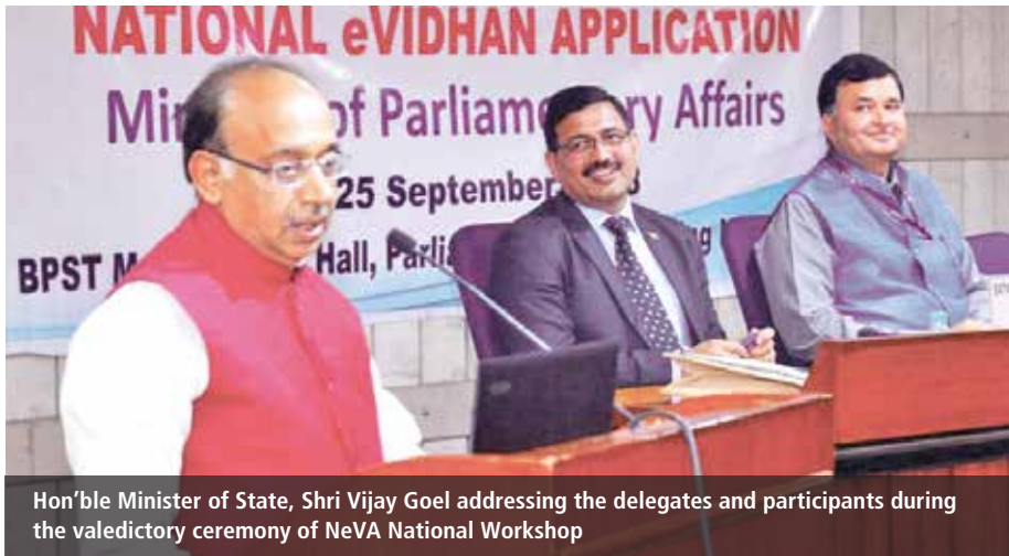
Hon'ble Minister of State, Shri Vijay Goel addressing the delegates and participants during the valedictory ceremony of NeVA National Workshop