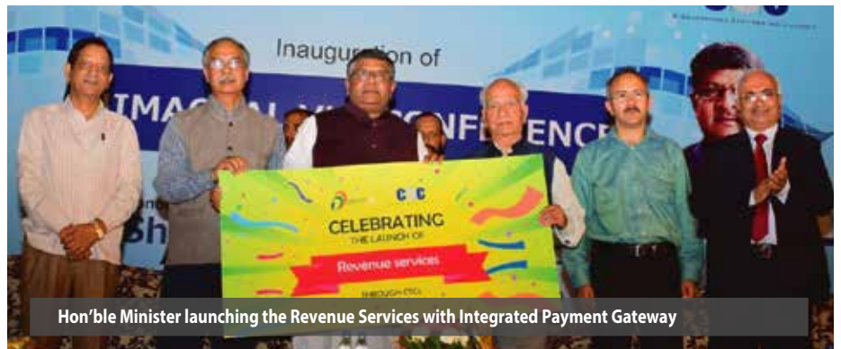
Hon'ble Minister launching the Revenue Services with Integrated Payment Gateway

During a conference, the Minister said that he has specifically visited Himachal Pradesh for the conference as most of the VLEs were unable to visit New Delhi earlier in March 2017. He appreciated the work done by VLEs in running the Common Citizen Centres and providing various kind of services to citizens in the rural areas of Himachal Pradesh. The Minister added that he hope the VLEs will continue to expand the scope of Digital India Program by providing quality services at the doorstep of the citizens.