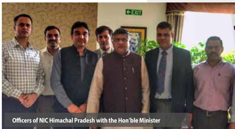
Officers of NIC Himachal Pradesh with the Hon'ble Minister