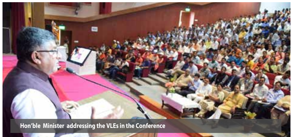
Hon'ble Minister addressing the VLEs in the Conference