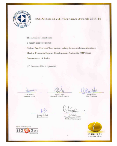
Fig 3.10 CSI Nihilent Award for Excellence

NIC operates one of the largest High Definition Video Conferencing Networks in India, providing services since 1995. These services are instrumental in monitoring Government Projects, flagship programs of the Prime Minister, various schemes, handling Public Grievances, overseeing Law and Order, conducting RTI case hearings, enabling Distance Education, Tele-Medicine, monitoring Election processes, and launching new initiatives. NIC's VC services are regularly