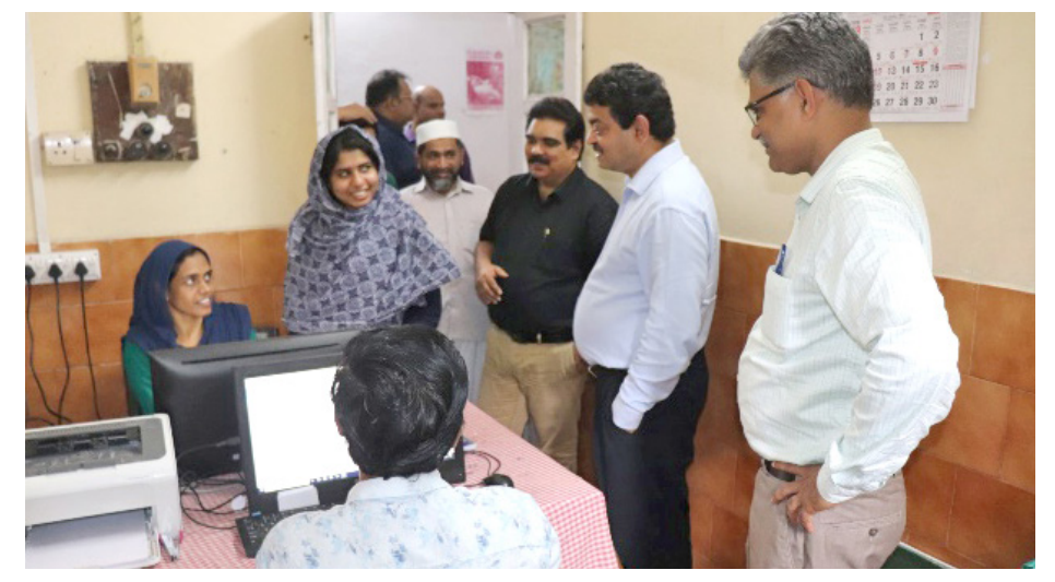
▲ Fig 3.4: eHospital team visit Lakshadweep UT Government Hospital to take a comprehensive overview of the application usage at the user site.

GePNIC is the eProcurement System of the U.T. Administration of Lakshadweep. It facilitates tenderers to freely download the Tender